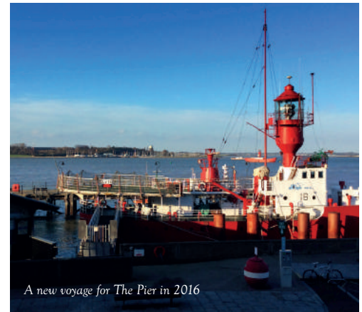
A new voyage for The Pier in 2016