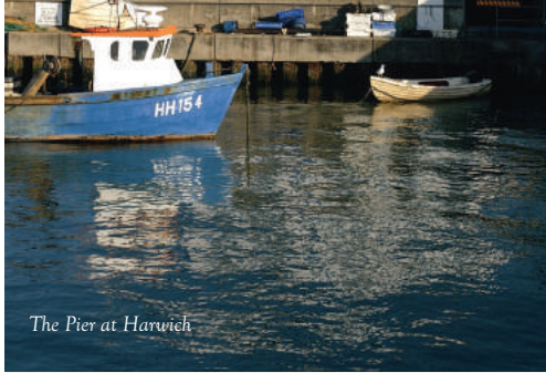
The Pier at Harwich