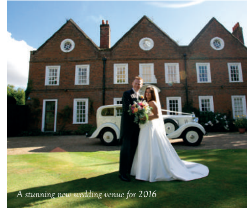
A stunning new wedding venue for 2016