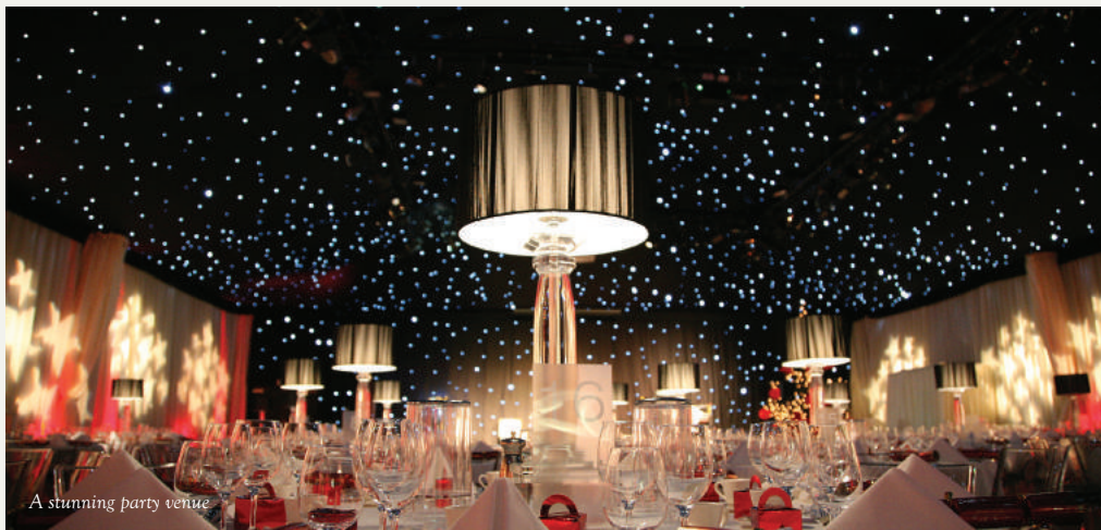
A stunning party venue