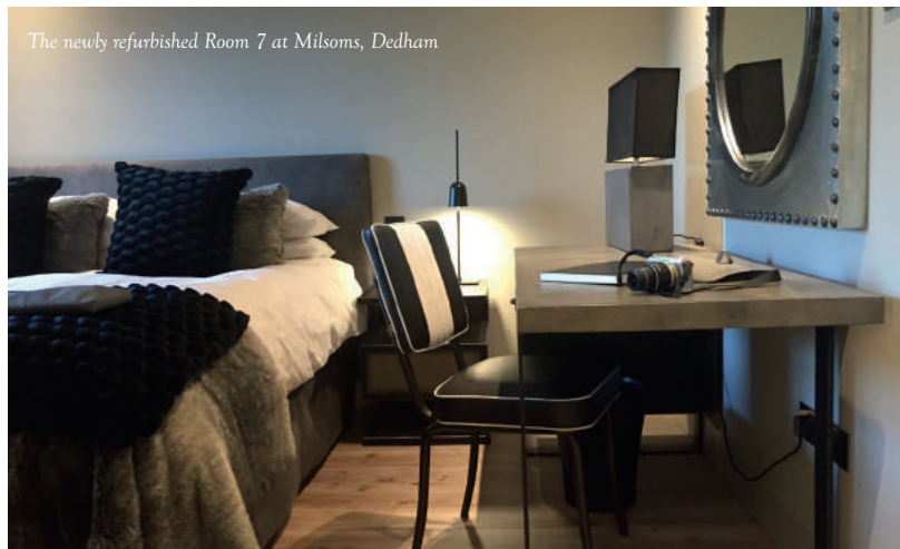
The newly refurbished Room 7 at Milsoms, Dedham

Call 01206 322367 to find out more and make a booking