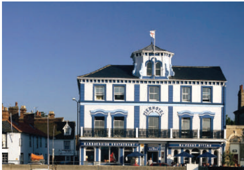
Artist's impression of the new balcony at The Pier

One of the things we are most excited about is extending the balcony, meaning we will have a handful of tables outside, allowing you to enjoy incredible views over the water to Felixstowe and Shotley – we're sure these tables will be very popular during the summer months.