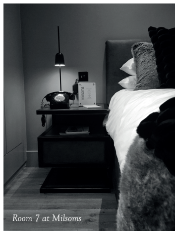
Room 7 at Milsoms