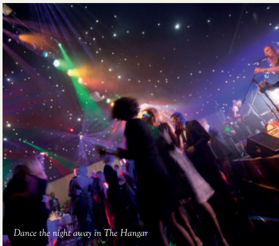
Dance the night away in The Hangar