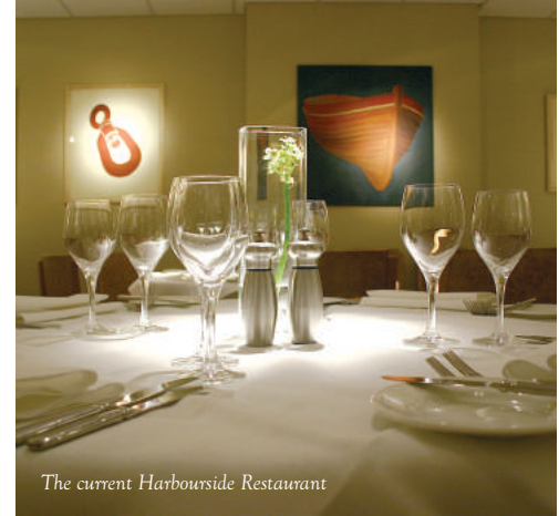
The current Harbourside Restaurant

It soon became apparent in the late 70s that our restaurant customers and a rather rowdy public bar did not really mix! We surrendered the full licence and created the Ha'Penny Pier with a bistro menu on the ground floor and the upstairs restaurant became a more sophisticated 'table cloth' seafood restaurant. Over recent years, and the move towards more informal dining, it has been difficult to have two very different restaurants in the one building. The food offered became increasingly 'blurred' with our downstairs diners requesting lobster and those upstairs asking for fish and chips!