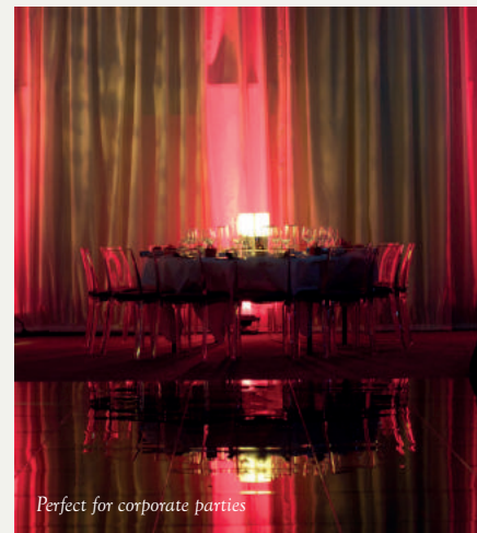
Perfect for corporate parties